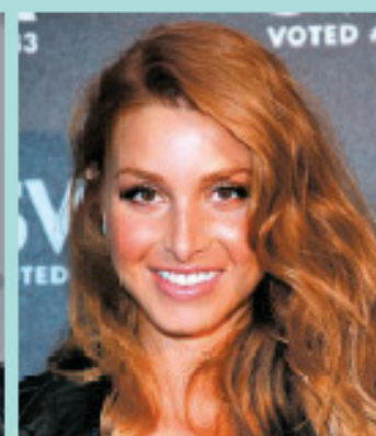
APRIL 2011 GINGER RED