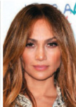
JUNE 2011 CARAMEL HIG HUGHTS

HER CURRENT COLOR The American Idol judge's many tweaks to her tone have yet to hit a wrong note. For this highlighted look, try L'Oréal Paris Touch-On Highlights in H60 Creamy Caramel, $13, drugstores.