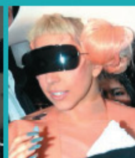
FEBRUARY 2011 BLONDE AND PEACH