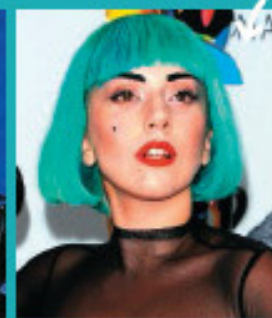
JUNE 2011 BRIGHT BLUE

HER CURRENT COLOR She's been everything from blonde to bald (!) and back again, thanks to a combination of wigs, extensions and good old-fashioned hair dye. You can get her striking blue shade temporarily with wash-out Splat Rebellious Colors in Aqua Blue, $10, Walgreens.