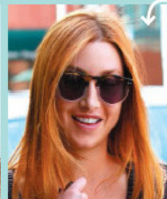
JUNE 2011 STRAWBERRY BLONDE

HER CURRENT COLOR We admire Whitney's adventurous spirit as well as the gorgeous strawberry blonde she's sporting right now. Get it with Clairol Nice'n Easy in Natural Reddish Blonde 10B, $8, drugstores.