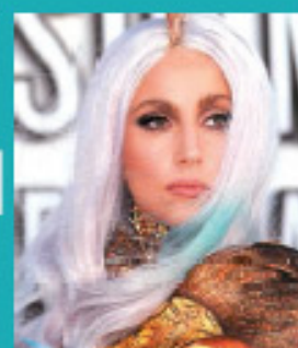
SEPTEMBER 2010 SILVER WITH BLUE TIPS