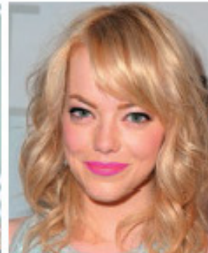
APRIL 2011 PLATINUM BLONDE