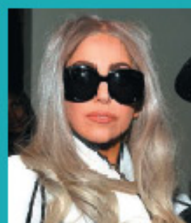
OCTOBER 2010 SILVERY GRAY