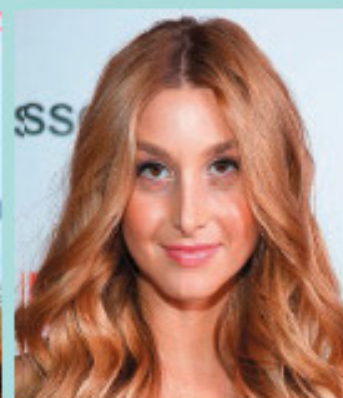
MAY 2011 DARK GOLDEN BLONDE