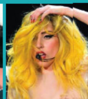
APRIL 2011 NEON YELLOW