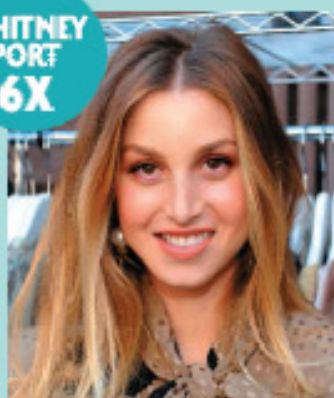
SEPTEMBER 2010 PALE BLONDE WITH ROOTS