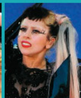
MAY 2011 BLACK AND BLONDE