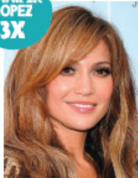
JUNE 2010 TAWNY ON TOP