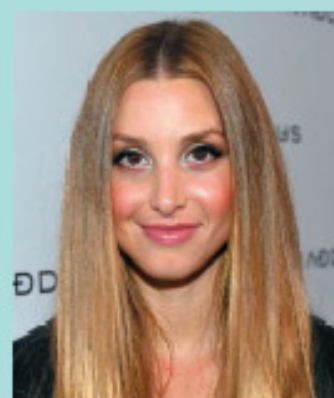
NOVEMBER 2010 GOLDEN BLONDE