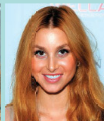
MAY 2011 APRICOT BLONDE