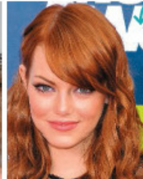
JUNE 2011 MEDIUM AUBURN

HER CURRENT COLOR Emma gets an Easy A for her hair-color efforts, especially this latest auburn shade. Try Garnier Nutrisse Nourishing Color Creme in Light Reddish Brown, $7.50, drugstores.