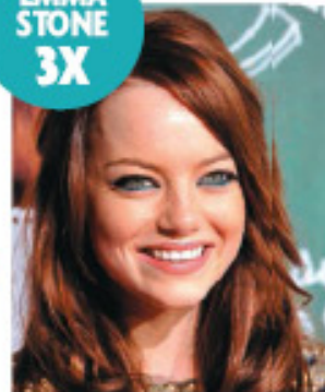
SEPTEMBER 2010 DEEP AUBURN